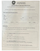
stewardship form 1.JPG 1350K