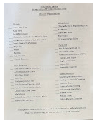
stewardship form 2.JPG 1287K